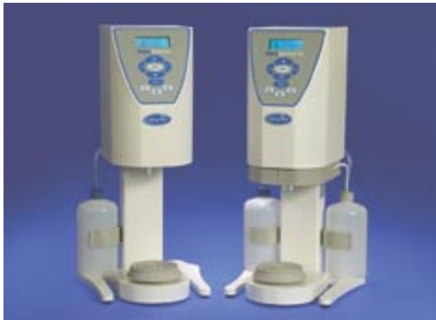
The use of accurate dispensing equipment increases your consistency and product performance.

Gypsum that has already set, called slurry water in its liquid form or bench dust in its solid, acts as a catalyst when in contact with unset gypsum and causes changes in the set and working times. Don't mix gypsum stones and plasters in the same bowls used for phosphate investments. The phosphate can keep the gypsum from setting properly.