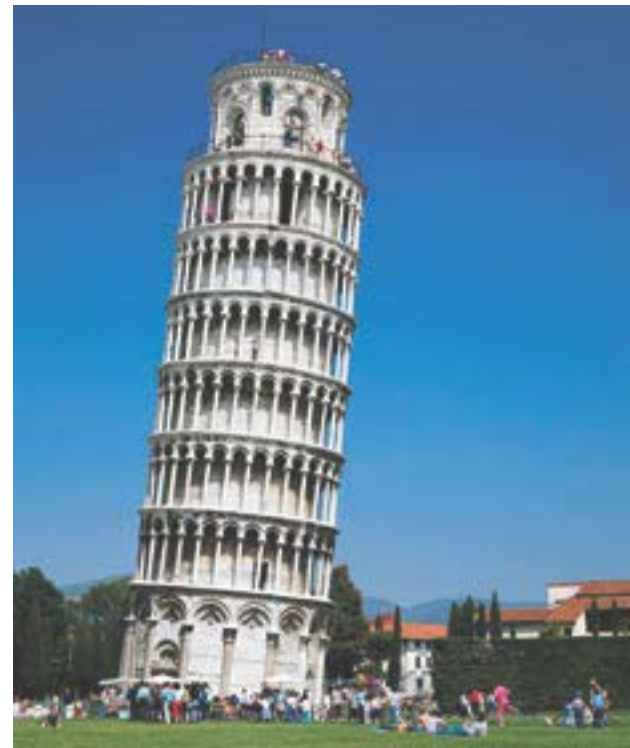
Without a great foundation, the remainder of your artistry wont be worth much.