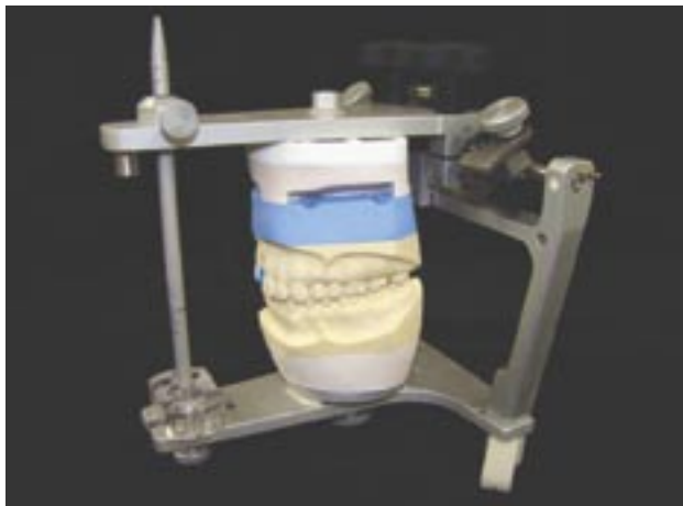
Professional model work leaves a professional image of you.

Remember, that what you do with your gypsum work is the foundation that the remainders of the processes are built upon. The architecture won't be remembered if the foundation fails. Beginning with a well done foundation helps to insure that your restorative creativity will be long lived and professionally appreciated. ①