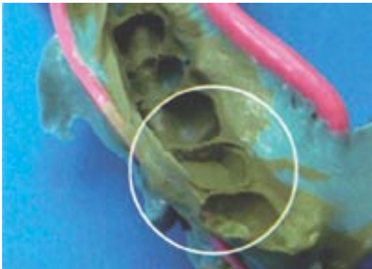
Inaccurate Impressions cause distortion and remakes.

Sloppy gypsum work leaves your practitioner clients with the image that you are a sloppy, non-professional laboratory. See that the model work and articulations are smooth, free from excess gypsum and clean. There should not be articulating ink, fingerprints or other unnecessary markings left on the casts when returned to clients.