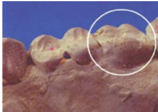
Improperly cured VPS Impression material causes Hydrogen bubbles in the gypsum model.

Impression materials and their use can be problematic. Do your best to match the linear expansion of your stone to the linear contraction of the impression materials that you receive. Stones generally range from .05 percent to .3 percent expansion. Impression materials are being reported from .0018 percent to .4 percent