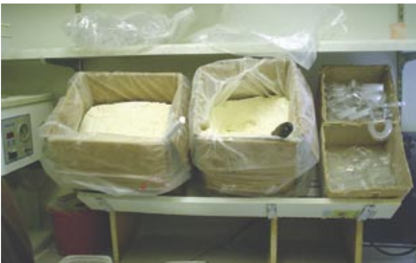
Bulk boxes left open to the atmosphere can change physical properties between the top and the bottom of the box.

Your knowledge base shouldn't stop with the chemistry. These seven keys to success with gypsum may sound like common sense, but they are often some of the most ignored. Ignore them at your peril.